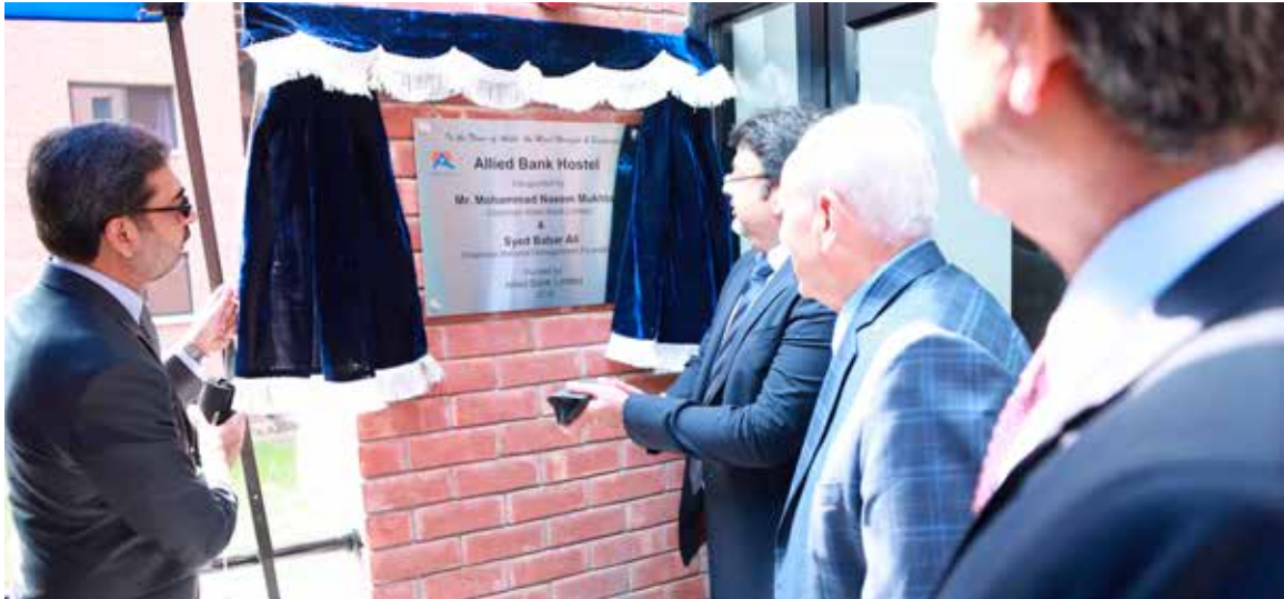
ABL's senior management inaugurates the Allied Bank Hostel

Allied Bank Limited (ABL) and LUMS have a longstanding partnership spanning 26 years. ABL's senior management visited LUMS in September 2019 to inaugurate the Allied Bank Hostel.