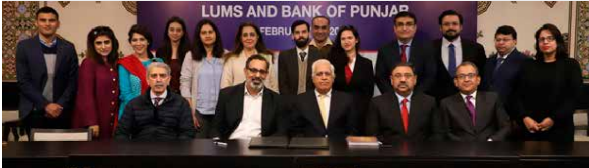
The senior management of the Bank of Punjab with the LUMS leadership at the MoU signing ceremony

To enhance the professional development of its employees, the Bank of Punjab signed an MoU with LUMS on February 13, 2020. Under the agreement, the Bank will finance its employees enrolled in the LUMS Executive MBA programme. The Bank also pledged to send employees to open