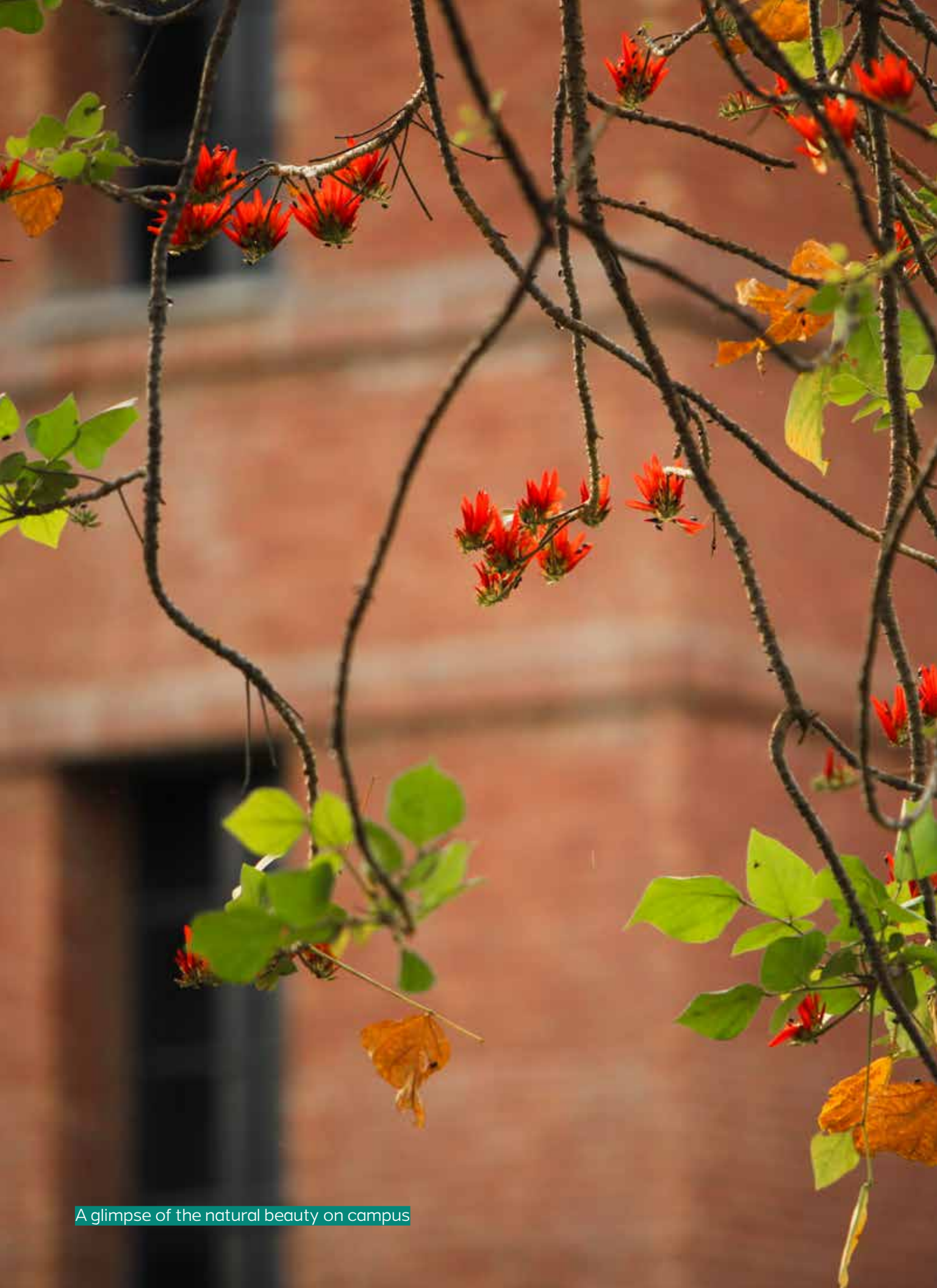
A glimpse of the natural beauty on campus