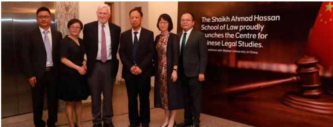
Guests at the inauguration of the Centre for Chinese Legal Studies

The Centre for Chinese Legal Studies (CCLS) at the Shaikh Ahmad Hassan School of Law, is dedicated to becoming Pakistan's premier hub for knowledge pertaining to Chinese law and practices. It facilitates the exchange of knowledge between Pakistani and Chinese academics through effective exchange programmes. The Centre also encourages cross-border collaboration between legal professionals and members of the academia for research.