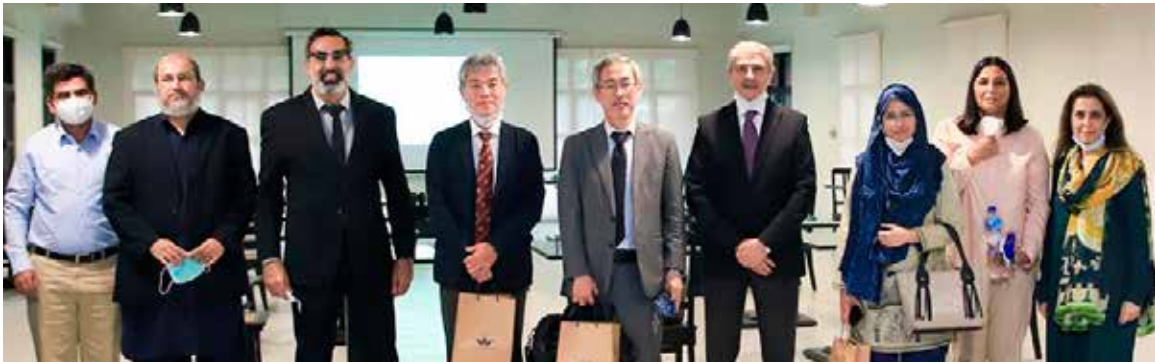
LUMS leadership and representatives from Mitsubishi Corporation

To mark their long-standing relationship, LUMS and the Mitsubishi Corporation convened on March 12, 2021, to discuss avenues of collaboration and growth opportunities in energy, health, and big data. The meeting was attended by the incoming and outgoing CEOs of Mitsubishi. Representing LUMS were