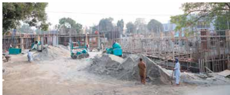
Construction of the new hostel in progress