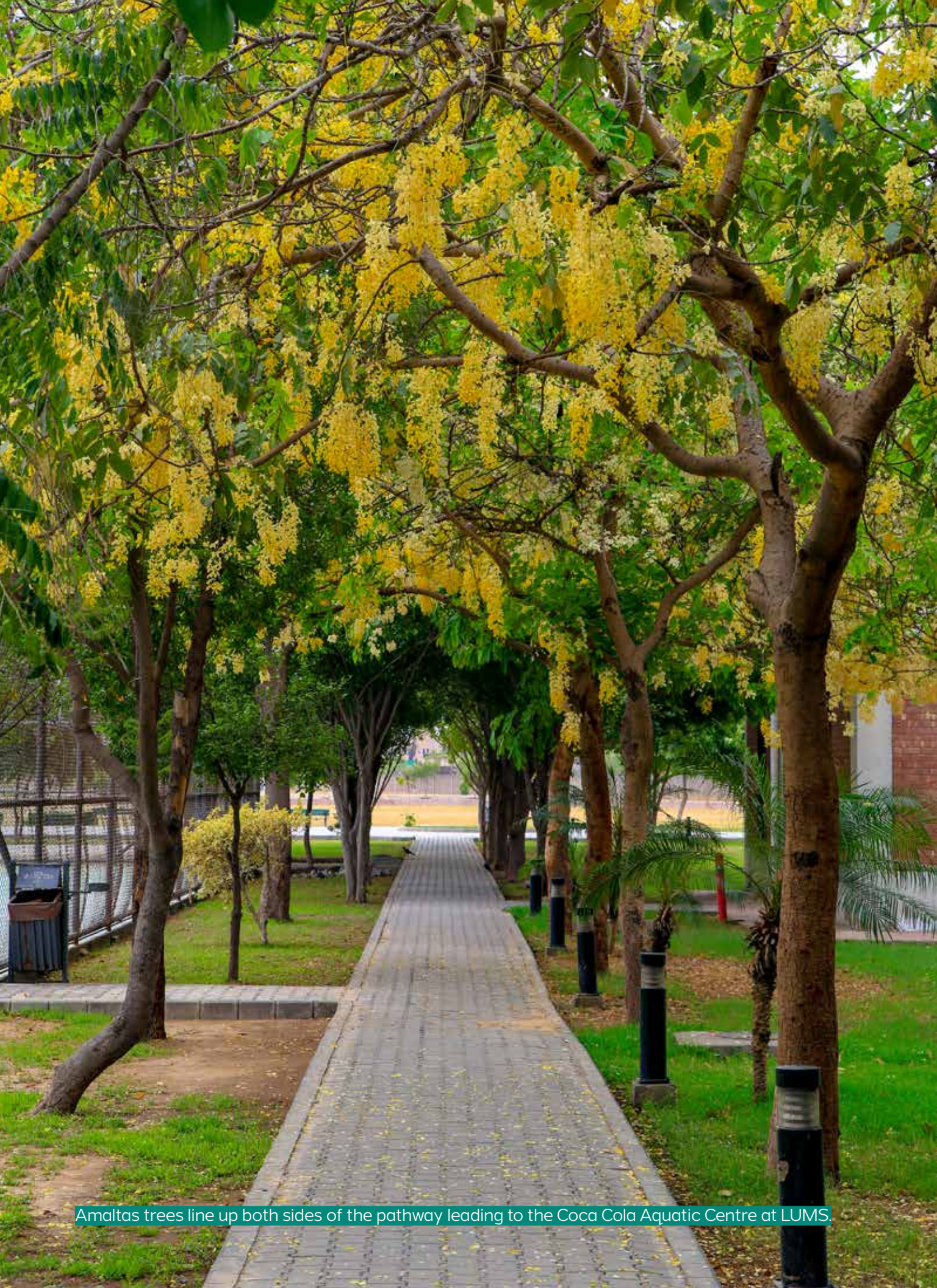
Amaltas trees line up both sides of the pathway leading to the Coca Cola Aquatic Centre at LUMS