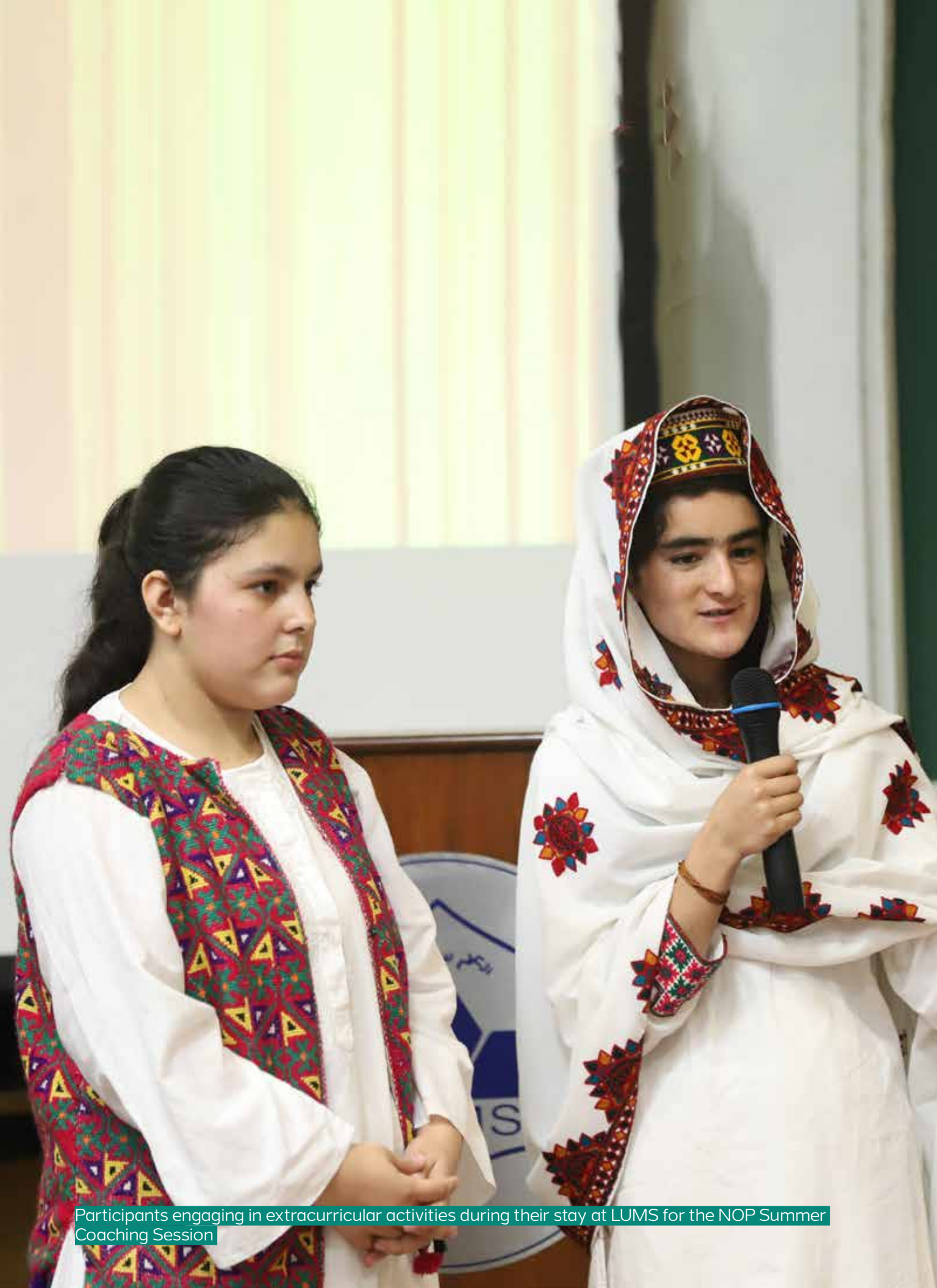
Participants engaging in extracurricular activities during their stay at LUMS for the NOP Summer Coaching Session