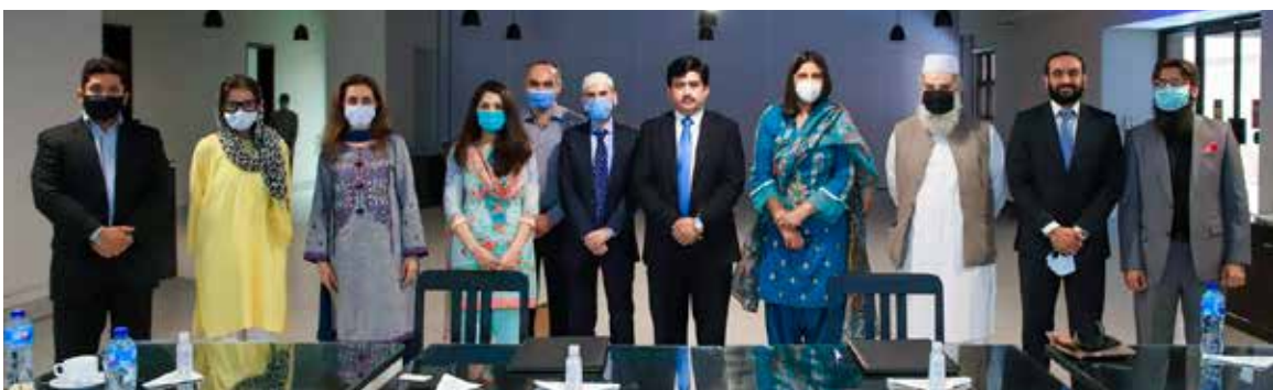
LUMS leadership and representatives from Arco Plastics