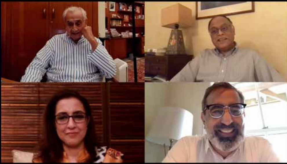
The Give A Day to LUMS Telethon featured senior management as well as alumni from around the world