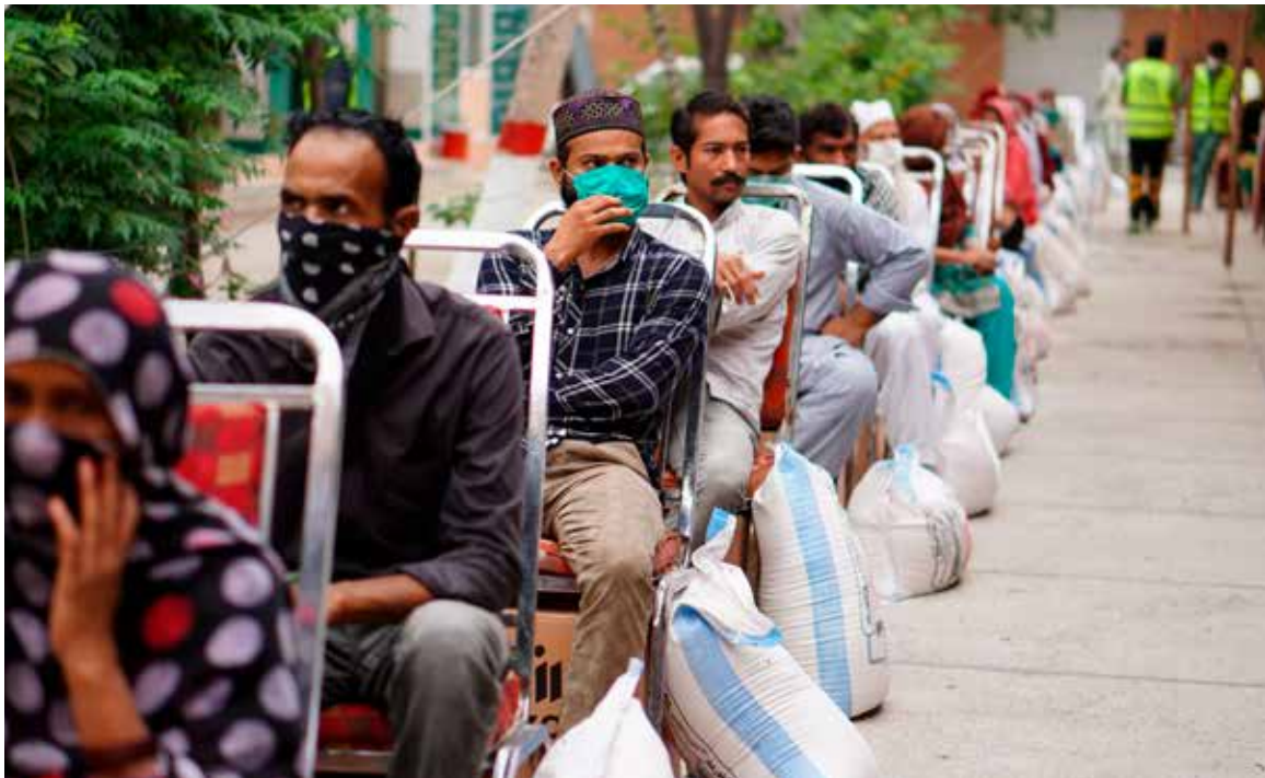
The LUMS COVID-19 Campaign was set up to help those affected by the pandemic

During the pandemic, the LUMS community came together to support deserving students, staff and vulnerable segments of society through the LUMS COVID-19 Campaign.