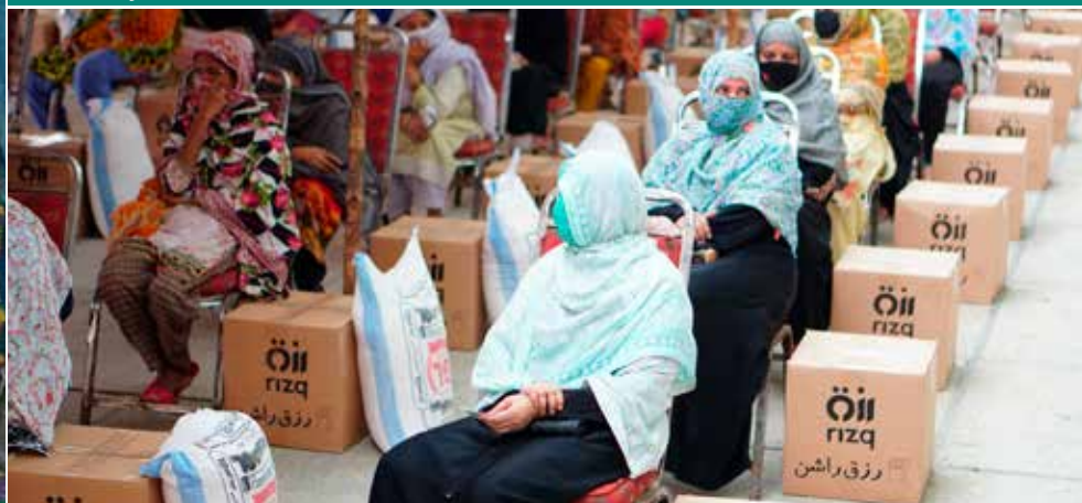
Rizq, a social organisation set up by LUMS alumni, initiated a national movement to mobilise resources to fulfil the hunger needs of those affected by the pandemic