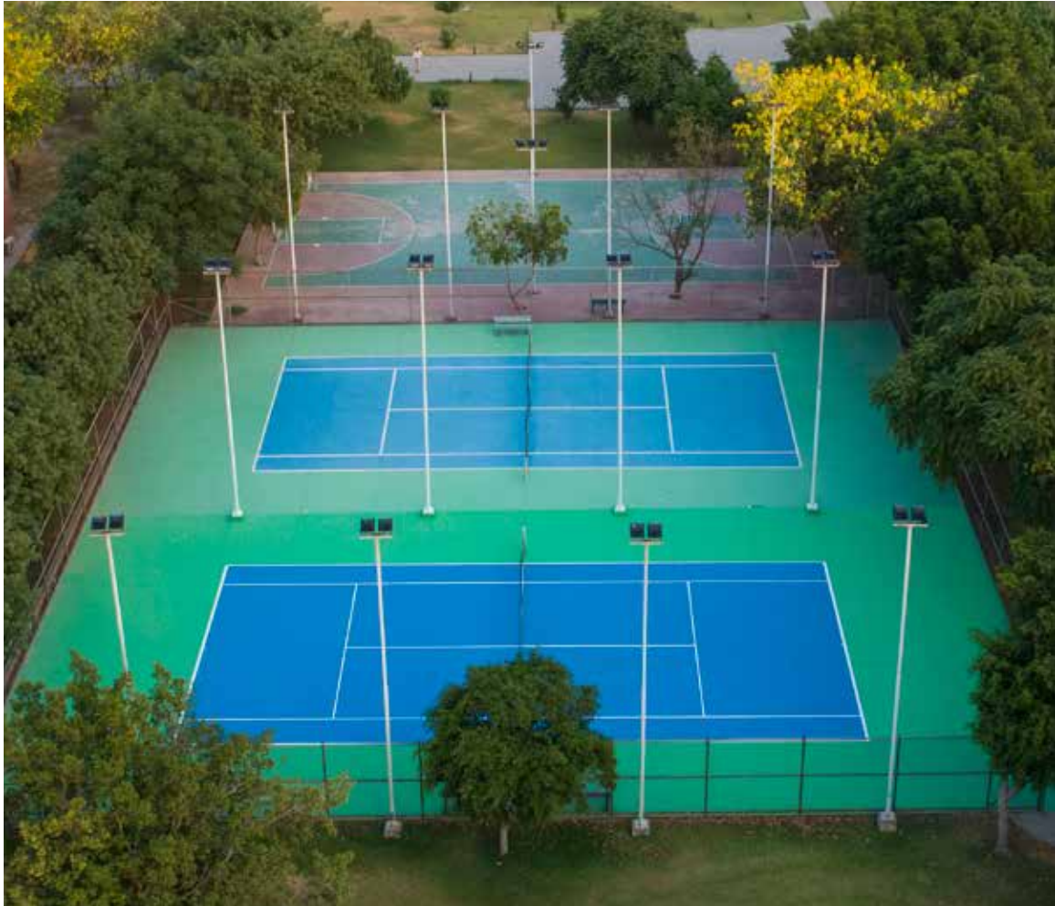
An aerial view of the tennis courts at LUMS