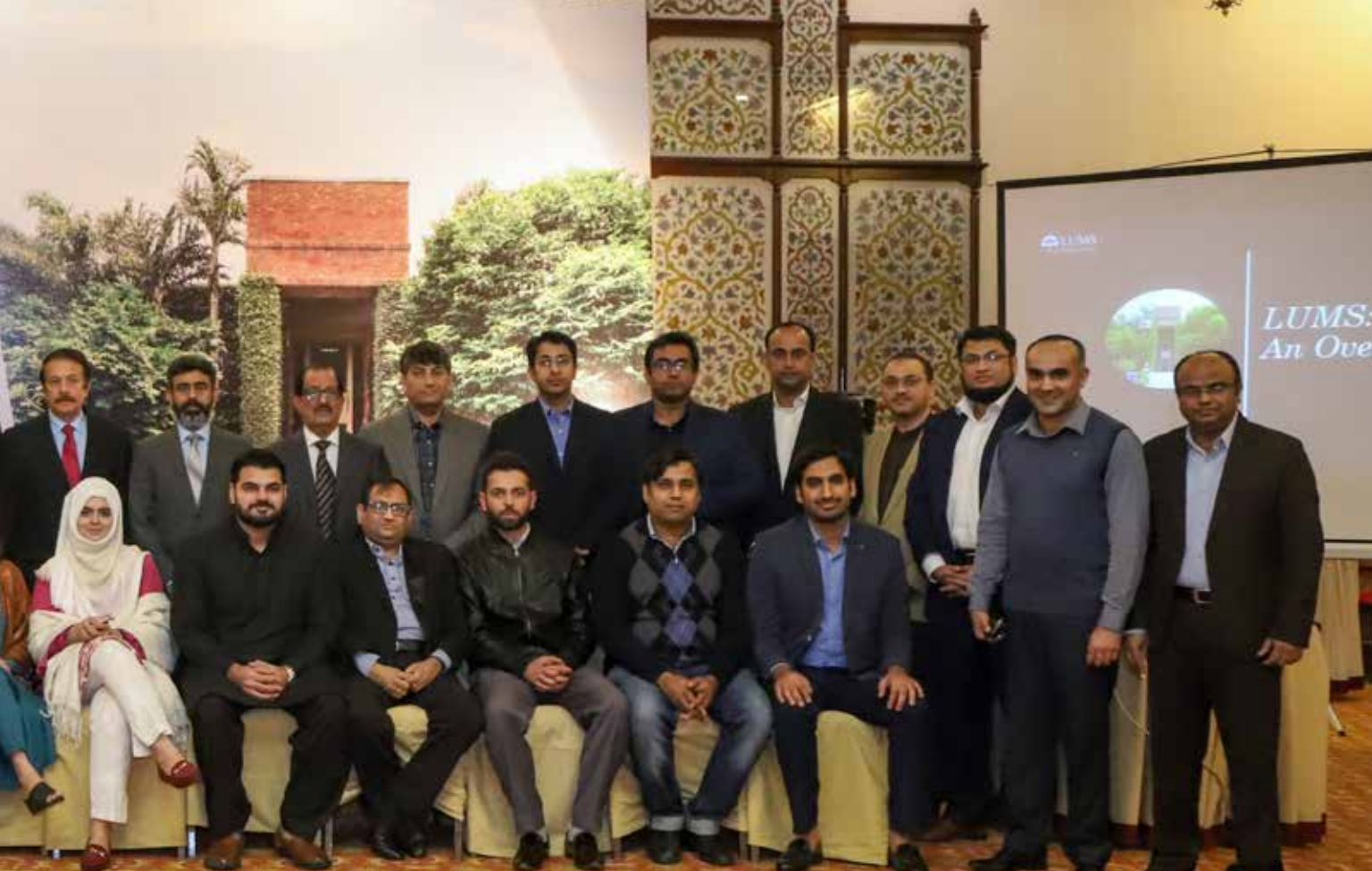
LUMS leadership and the Faisalabad community at the Annual Donor Dinner