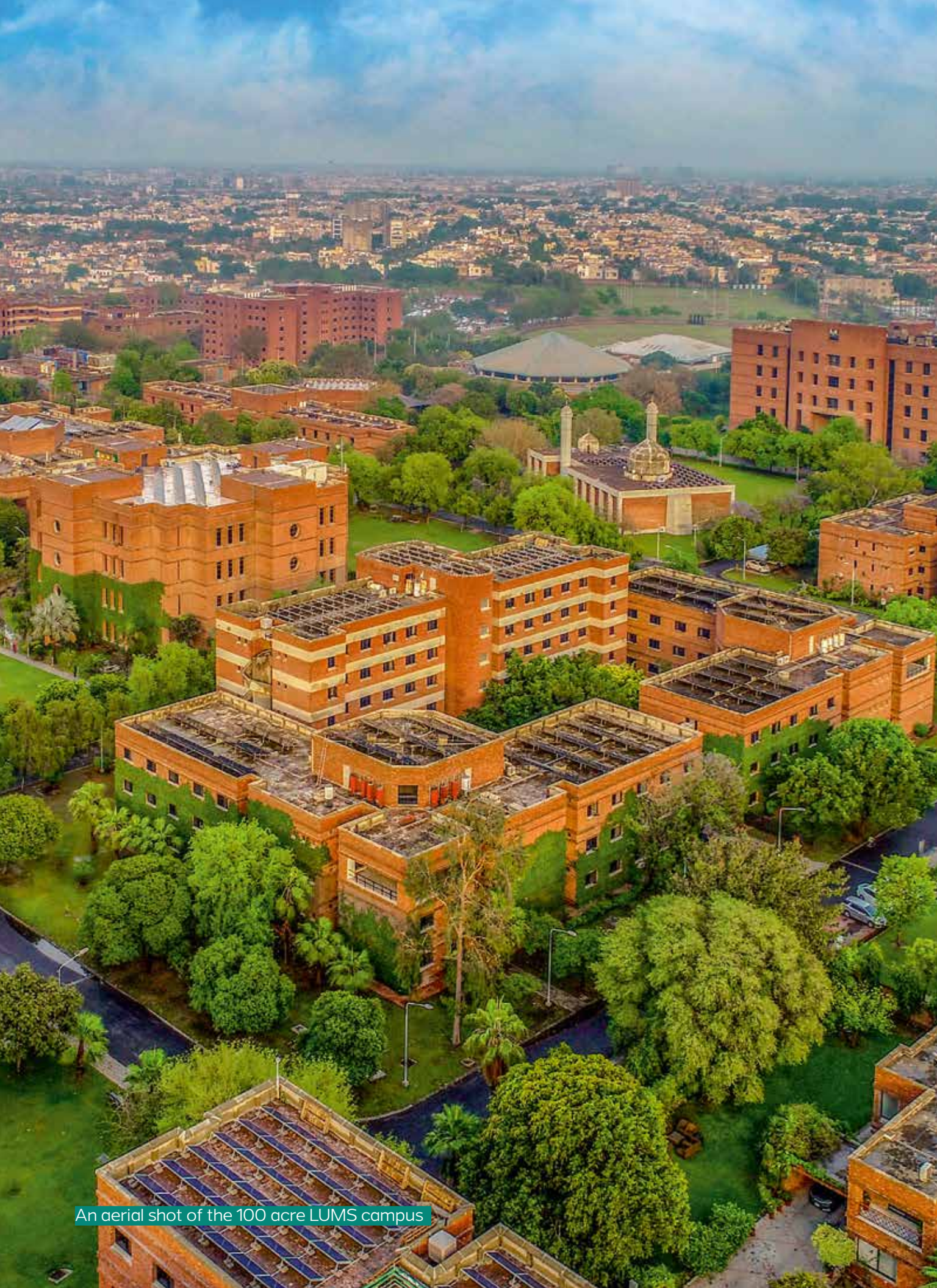
An aerial shot of the 100 acre LUMS campus