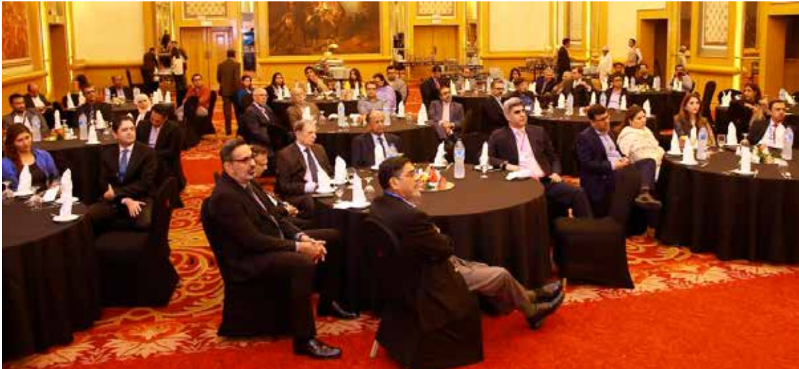
LUMS honours the University's long-standing supporters at the Annual Dinner in Karachi

The LUMS Annual Dinner held on December 13, 2019, in Karachi, brought together the University's esteemed donors and senior leadership for an engaging evening. Hosted by the Office of Advancement, the event aimed to provide the guests with an overview of the groundbreaking work being done by students and faculty at LUMS and share the future direction of the University.