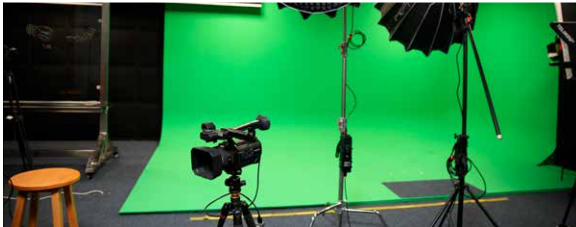
Inside the LUMS Learning Institute's recording studio

The LUMS Learning Institute (LLI) provides leadership in teaching and learning. It offers a wide variety of programmes, workshops, services, and supports the LUMS community in enhancing teaching and learning experiences, through four interconnected programmes.