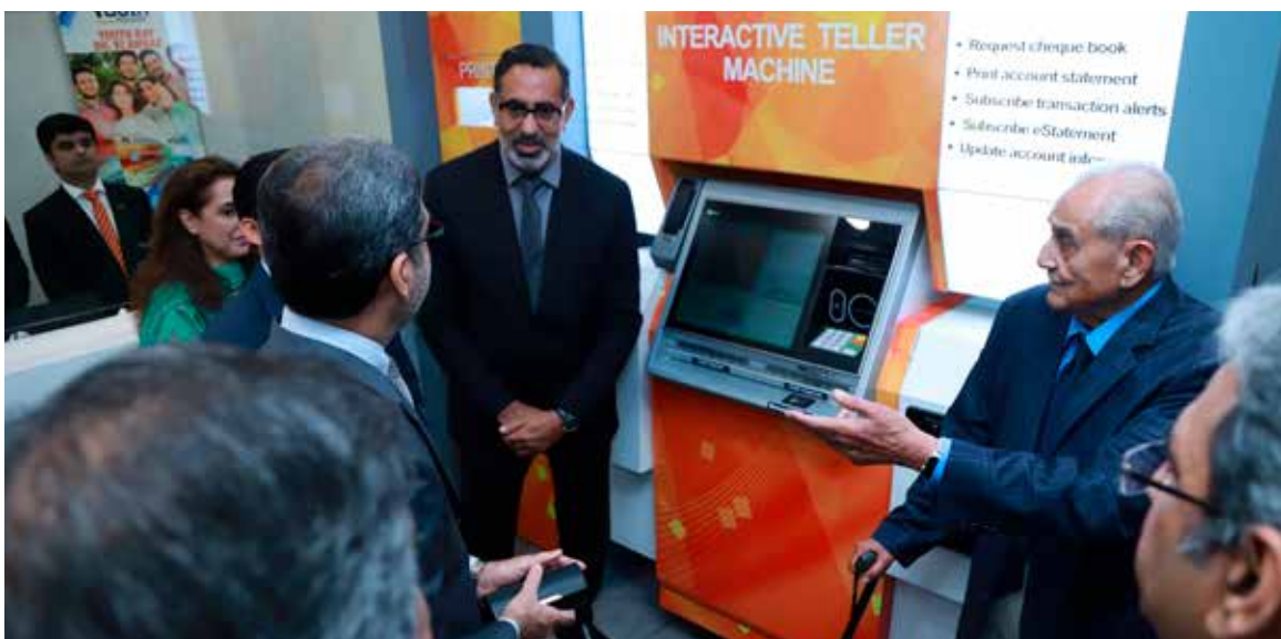
The ABL leadership also inaugurated the Bank's first self-service branch on the LUMS campus