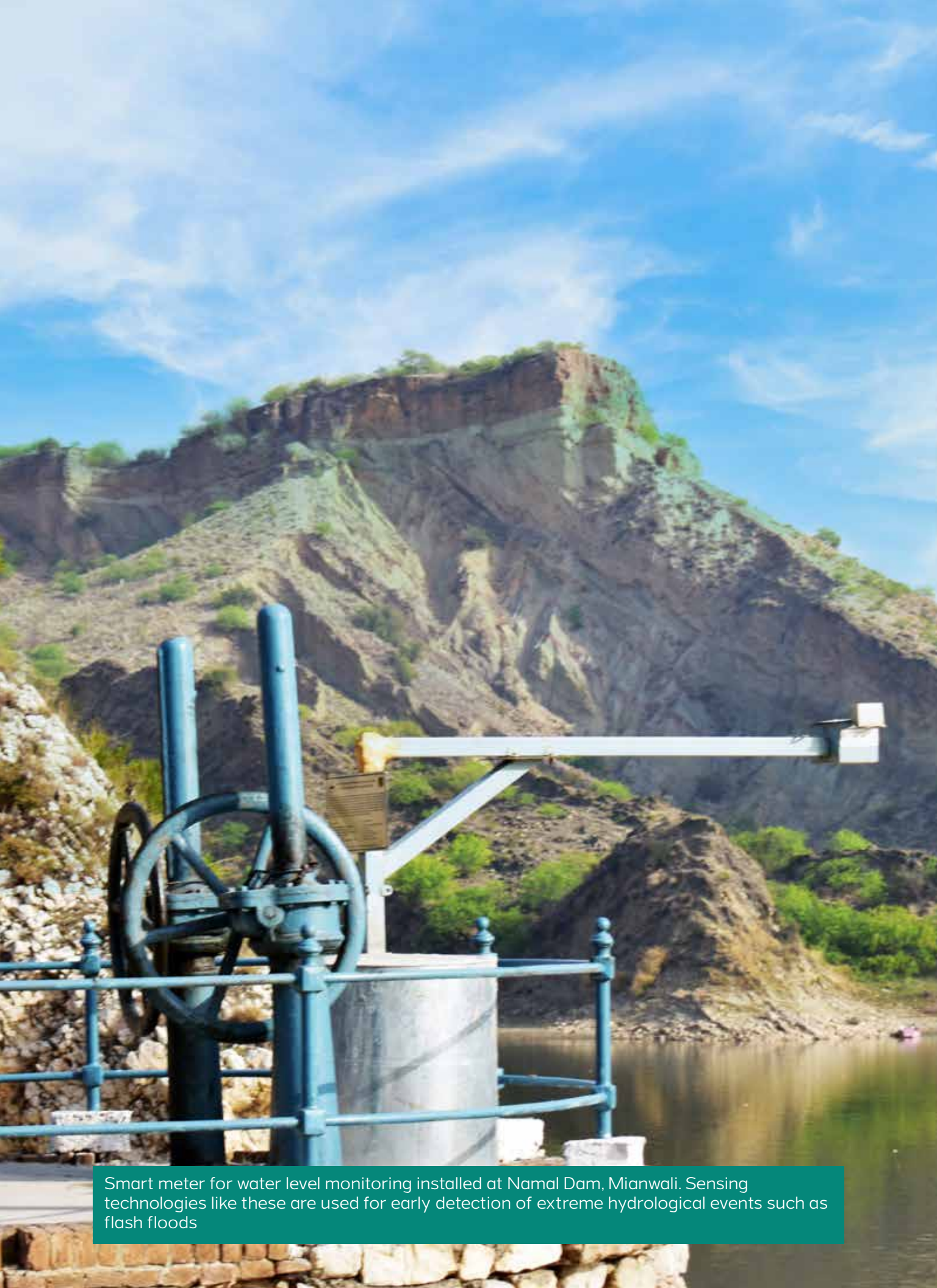
Smart meter for water level monitoring installed at Namal Dam, Mianwali. Sensing technologies like these are used for early detection of extreme hydrological events such as flash floods