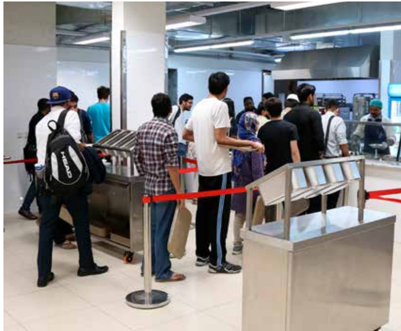
The Pepsi Dining Centre at LUMS

During the years 2019-21, PepsiCo donated USD 100,000 as part of their agreement to donate USD 500,000 towards the renovation of the building and modernisation of the kitchen equipment.