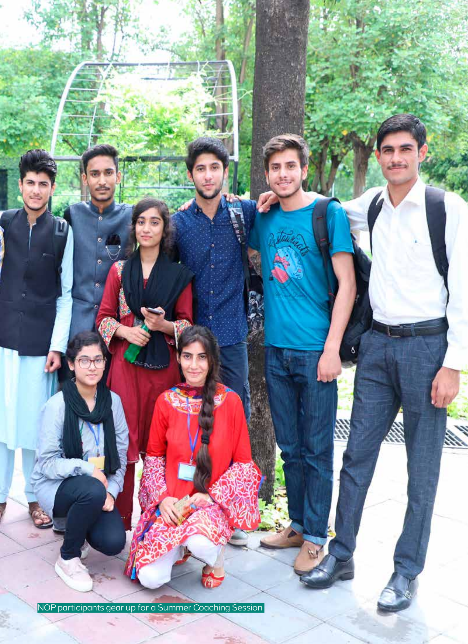
NOP participants gear up for a Summer Coaching Session