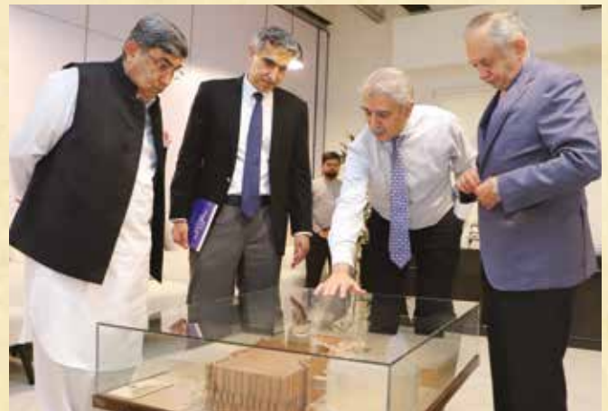
LUMS and the Atlas Group share a long history of association and mutual interests