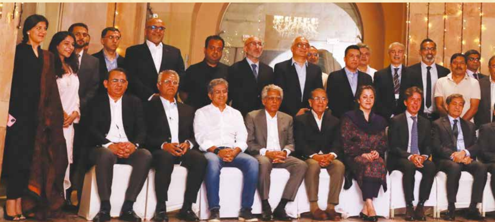
Donor engagement dinner with donors and alumni in Islamabad

Through discussions and presentations, the guests were apprised of the recent achievements of the University and its high-impact initiatives in the areas of innovation, knowledge creation, and community development. The sessions also emphasised that strong industry-academia partnerships and investment in research-based solutions are the only effective ways of tackling local and regional challenges.