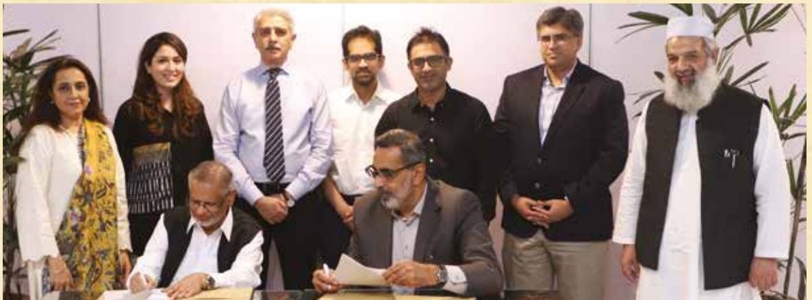
GFC Fans signs an MoU with LUMS to sponsor an NOP scholar