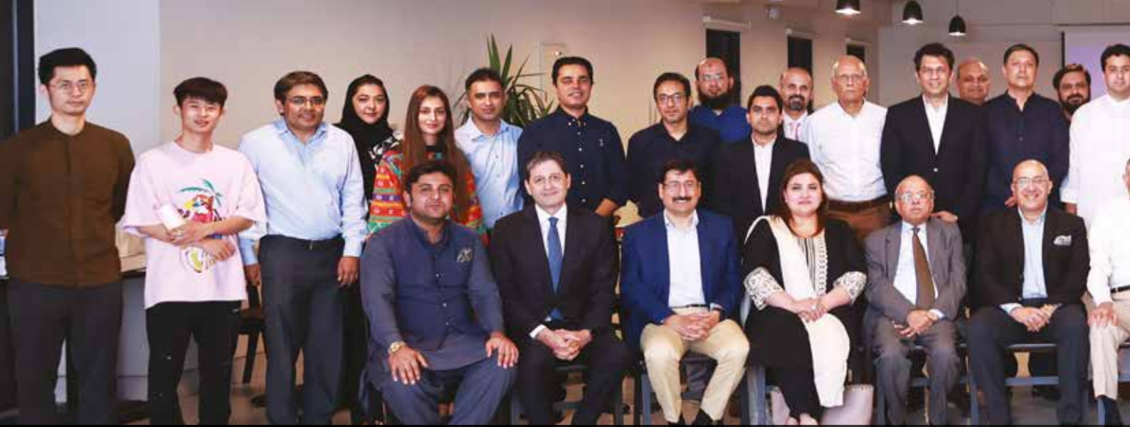
LUMS leadership and senior management with prominent donors and alumni in Lahore at a networking dinner